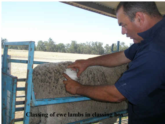
Classing of ewe lambs in classing box

Adult Flock average: 18.9-19.8 micron, 8.0-9.3kg.