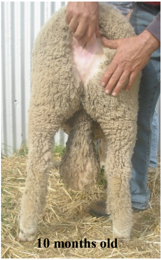
10 months old